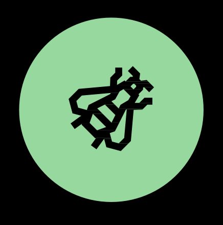
We produce honey of the rooftop of Grieghallen that are used in our menus