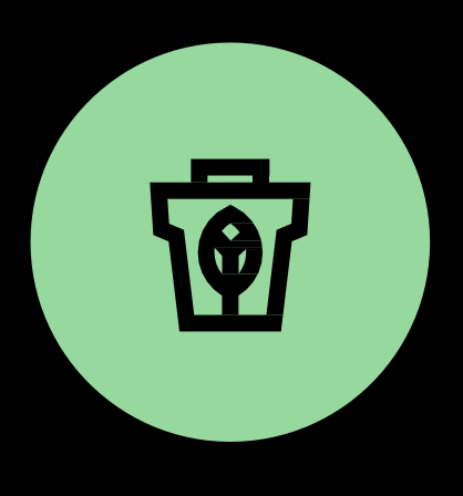
We recycle and sort at source