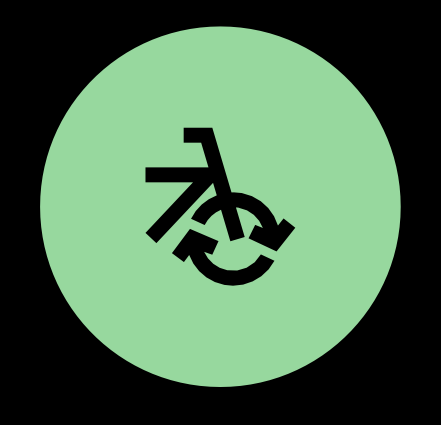
We encourage you to travel environmentally friendly to Grieghallen