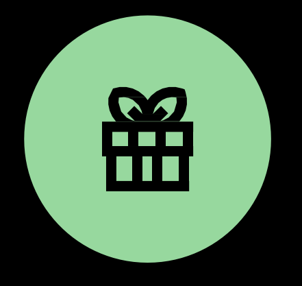
To the ones who have everything we encourage you to gift them a cultural experience